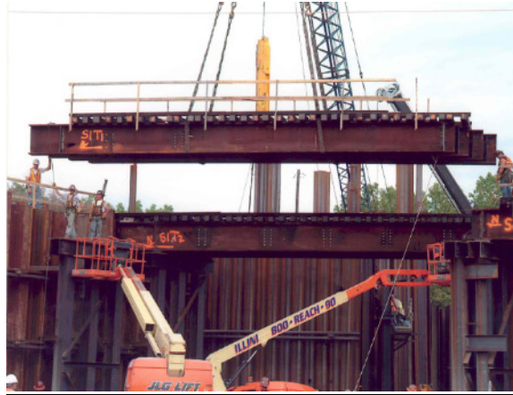
Riverdale Emergency Bridge Riverdale, Illinois