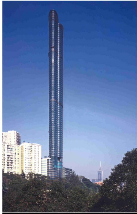
Highcliff Apartments Hong Kong, China