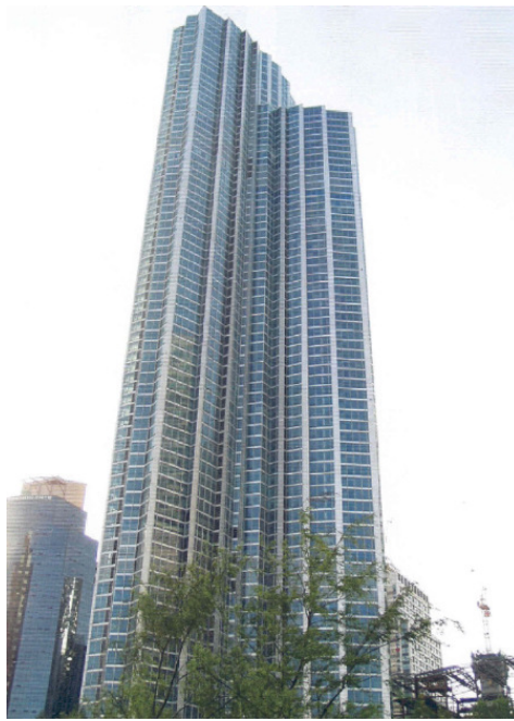
Tower Palace III Seoul Korea