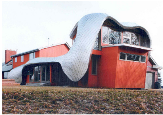
Spring Prairie Residence Spring Prairie, Illinois