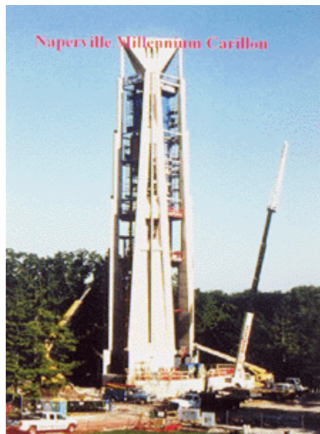
The Naperville Millennium Carillon Naperville, Illinois McCluskey Engineering Corp.