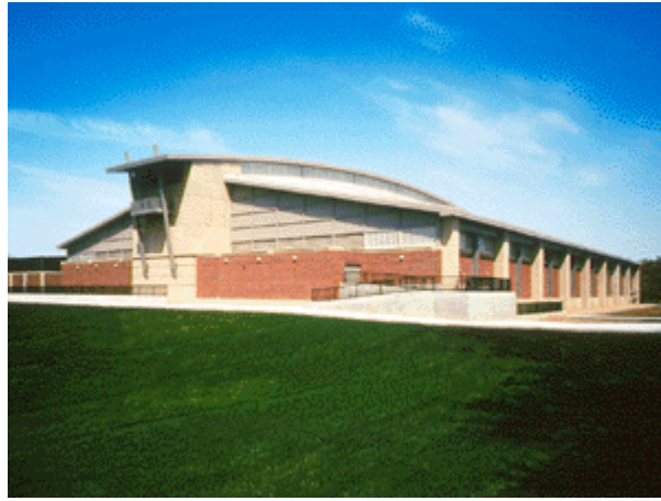
The Indoor Football Practice Facility at The University of Illinois at Urbana/Champaign Champaign, Illinois Tylk Gustafson Reckers Wilson Andrews, LLC.