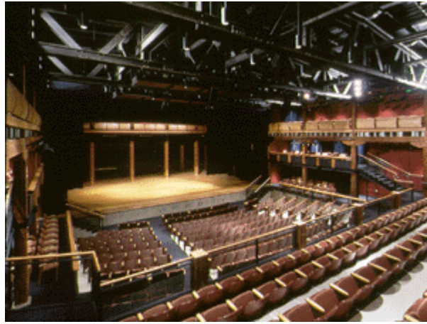
Schauer Arts Foundation and Activities Center Hartford, Wisconsin Holabird & Root