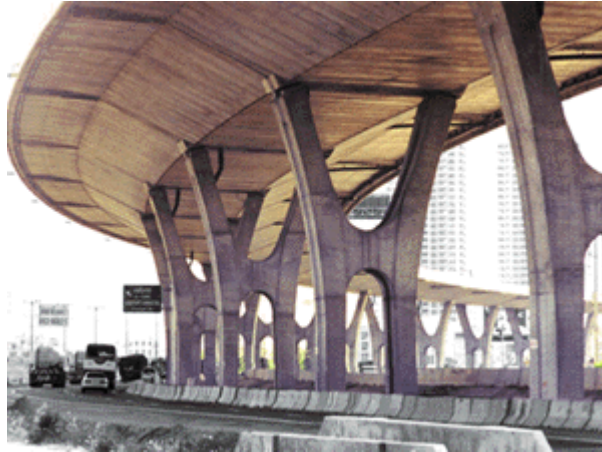
Bang Na-Chonburi Expressway Bangkok, Thailand J. Muller International